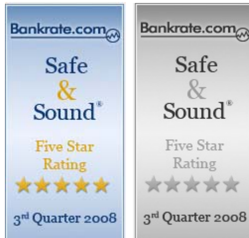
120x240 vertical banner