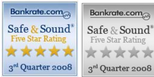
125x125 square button